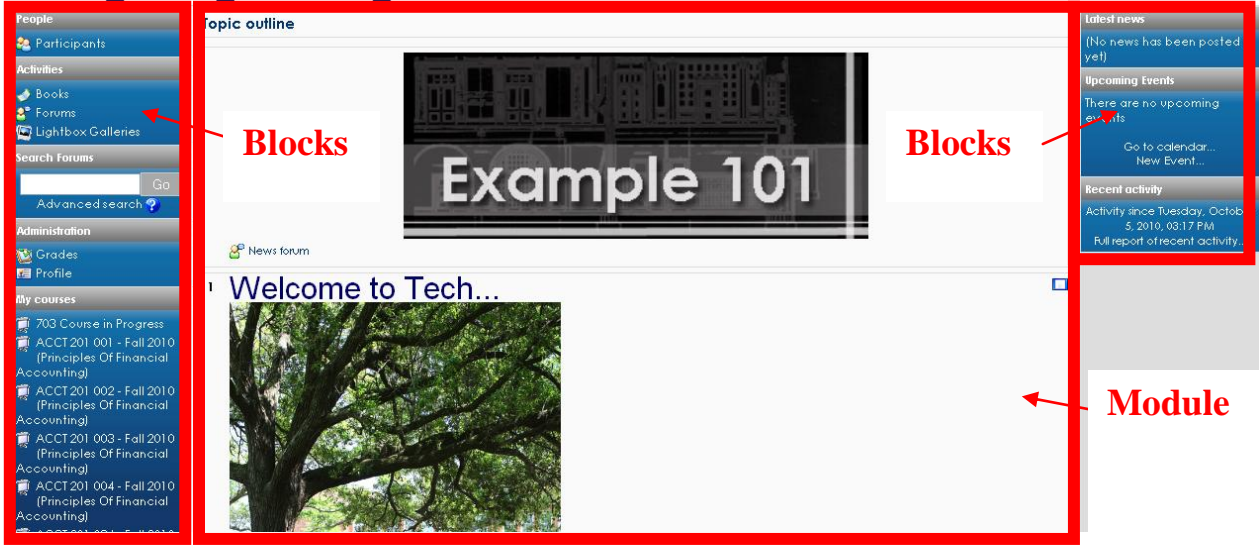
Modules (may be arranged by topics or by weeks)